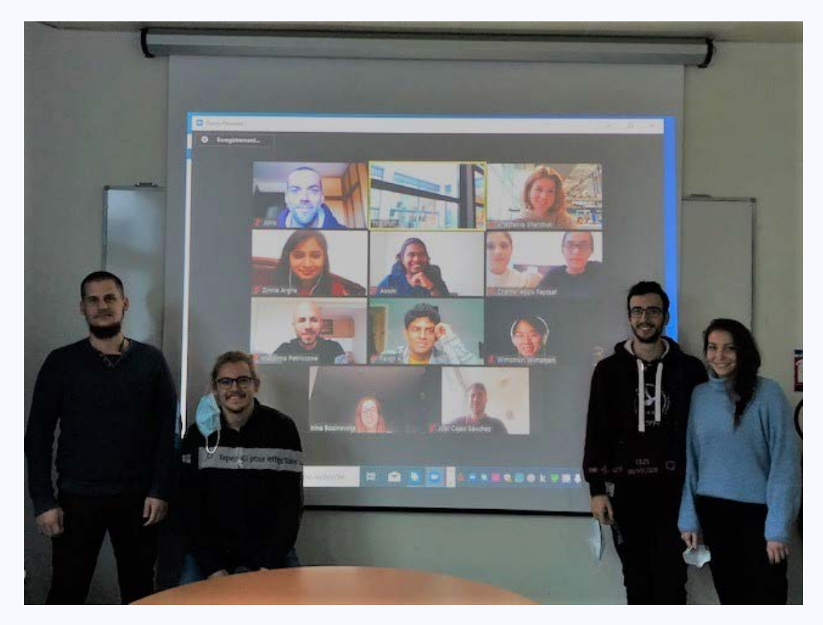
A final picture of all the ESRs after completion of the core course

This allowed us to get a grasp of the impact of our research on the wider scientific community. If the Core Course was an indicator of future events, we look forward to tutorials and workshops, especially to strengthen our knowledge and impact as young scientists (with the possibility of more social coffee breaks, restrictions eased). Following the completion of the Core Course, we began our research work at our respective institutions.