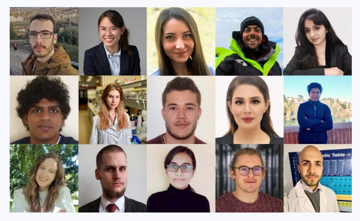
ESRs of the CCIMC Network

We embarked on our Ph.D. journeys within the last couple of months. This included the Core Course, moving to different destinations, and demonstrating our resilience in adapting to challenging times. While managing to establish effective working relationships and showing scientific nous to produce meaningful work from the get-go. The excitement of moving to a foreign country, new city, and a different lab environment proved to outweigh the general gloom of the COVID-19 pandemic.